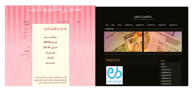
Figure 1. A sample e- portfolio from study participants