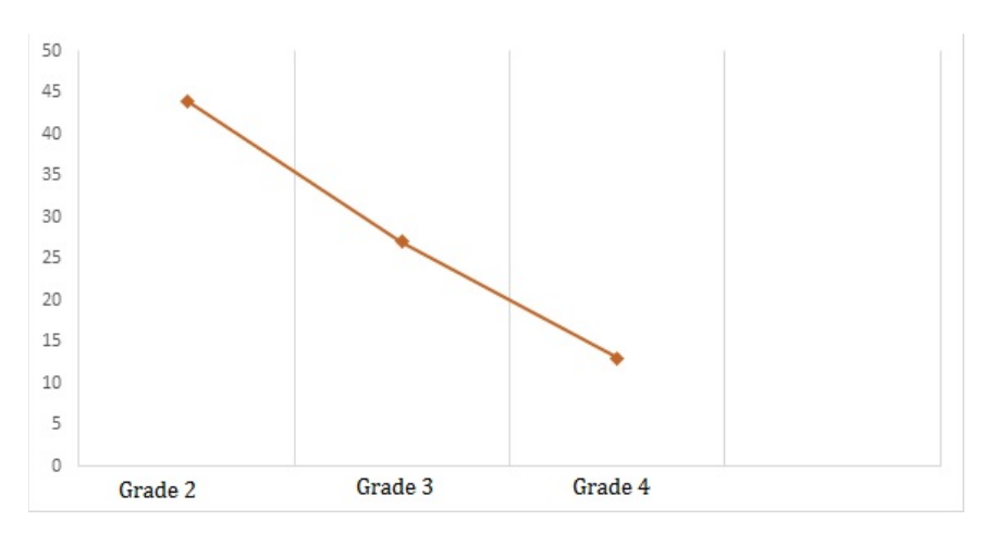
FIGURE 1. Level of interest in the subject by classes

On the next question, the data was slightly higher (56%). However, such an indicator can still not be considered favorable. It can also result from low interest and motivation. Remarkably, when analyzing the questionnaires in which students answered "yes", it was found that most often this option was found in second-grade students, less often in fourth-graders, see Figure (1).